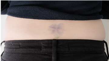
Mongolian Mark 1-